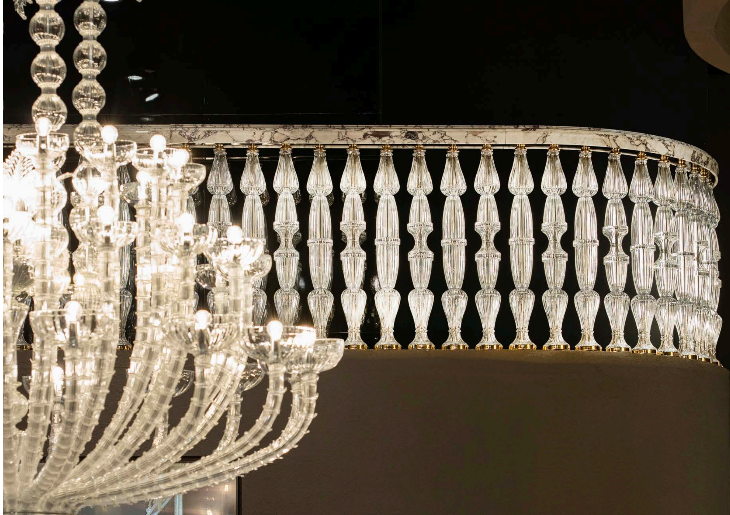
“Arianna&Dioniso” Luminous Balustrade