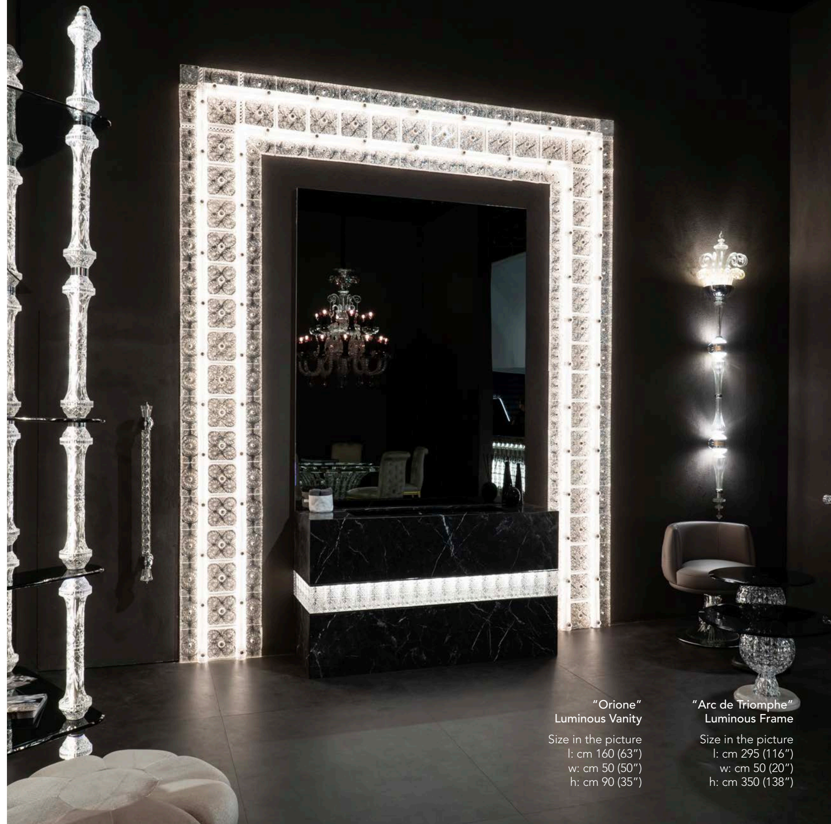
“Orione” Luminous Vanity

Size in the picture l: cm 160 (63") w: cm 50 (20") h: cm 90 (35")