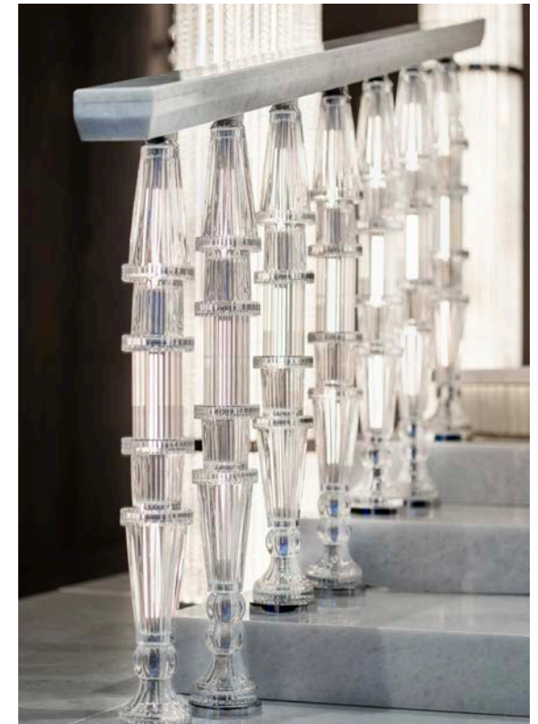
"Dafne" Crystal Luminous Balustrade

Size in the picture Ø: cm 36 (14") h: cm 340 (134")